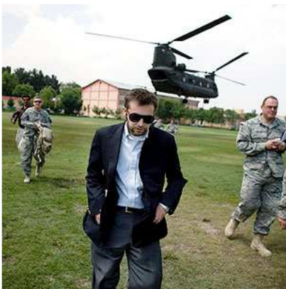
Michael Hastings at the ISAF base in Kabul, Afghanistan.

McChrystal reserves special skepticism for Holbrooke, the official in charge of reintegrating the Taliban. "The Boss says he's like a wounded animal," says a member of the general's team. "Holbrooke keeps hearing rumors that he's going to get fired, so that makes him dangerous. He's a brilliant guy, but he just comes in, pulls on a lever, whatever he can grasp onto. But this is COIN, and you can't just have someone yanking on shit."