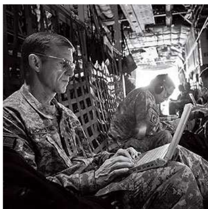
Gen. Stanley A. McChrystal, commander of NATO's International Security Assistance Force and U.S. Forces-Afghanistan, works on board a Lockheed C-130 Hercules aircraft between Battlefield Circulation missions.

Stanley McChrystal, Obama's top commander in Afghanistan, has seized control of the war by never taking his eye off the real enemy: The wimps in the White House